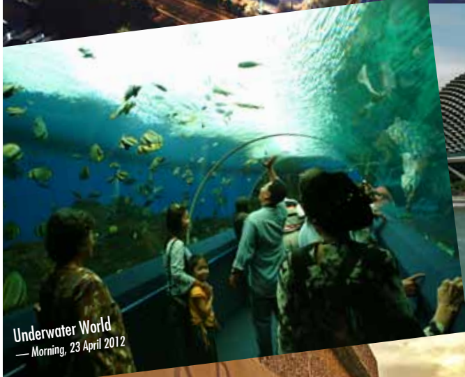
Underwater World — Morning, 23 April 2012