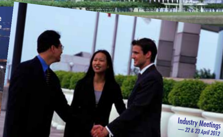
Industry Meetings — 22 & 23 April 2012