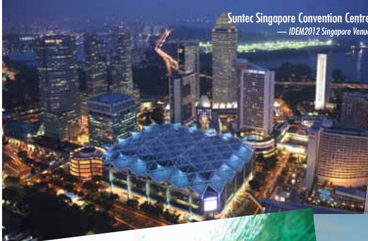
Suntec Singapore Convention Centre — IDEM2012 Singapore Venue